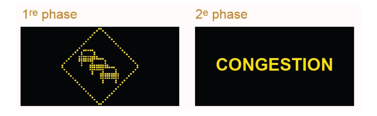
Figure 11 – Examples of pictograms that can be used on VMS