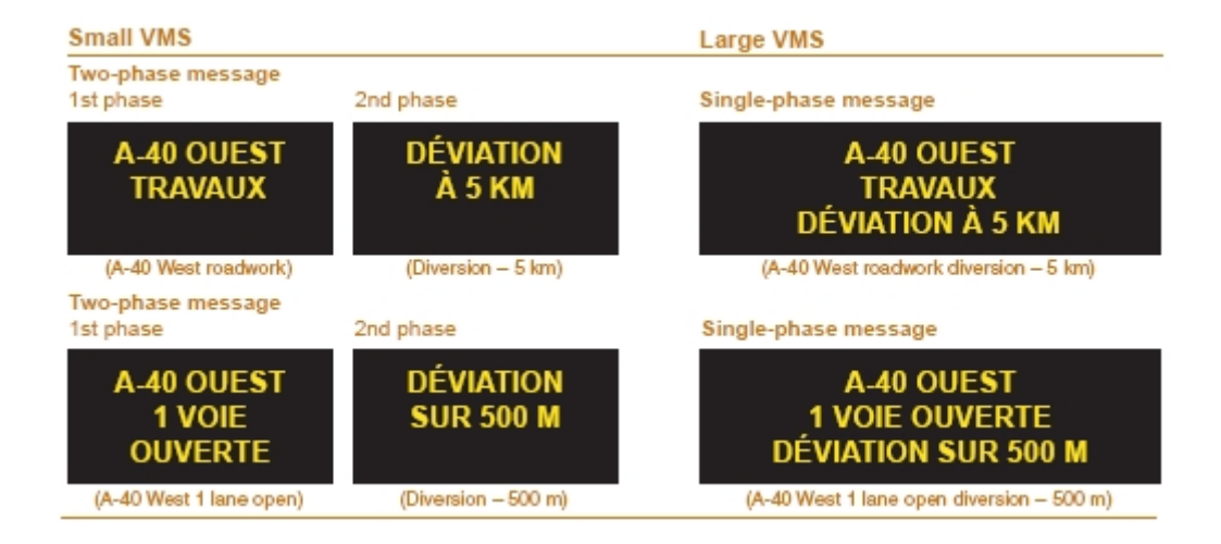
Figure 9 – Examples of the use of abbreviations