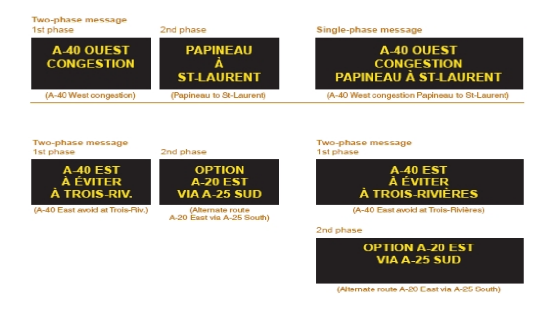
Figure 5 – Examples of messages reporting lane closures