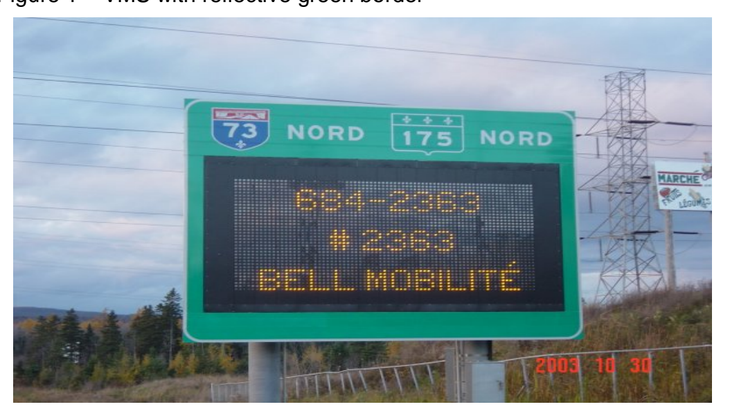
Figure 1 – VMS with reflective green border